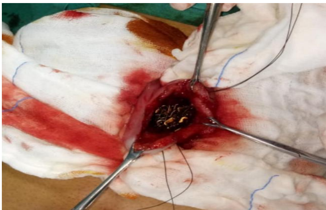
Figure 2-Intra operative – Gastrotomy with safety pins in situ