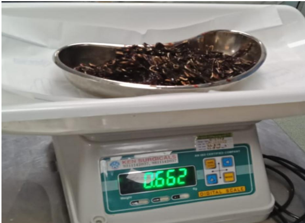
Figure 3- Around 600 grams of safety pins