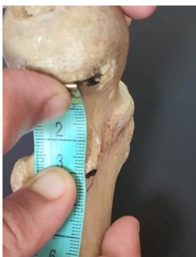
Figure 2: Femur neck length measured as the distance between the inferior margin of base of femur head and the lower end of intertrochanteric line.