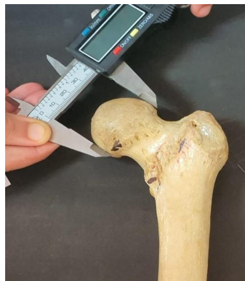
Figure 3: Femur head diameter measured as the distance between the upper and lower ends of femur head in craniocaudal axis.