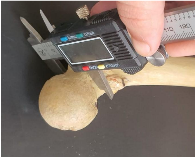
Figure 5: Femur neck thickness measured in anteroposterior axis at the level of a line joining midpoint between upper region of femoral head and base of greater trochanter and midpoint of femur neck length.