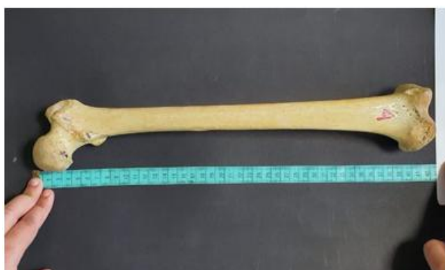
Figure 1: Femur length measured from highest point of femur head to the lowest point of medial condyle.