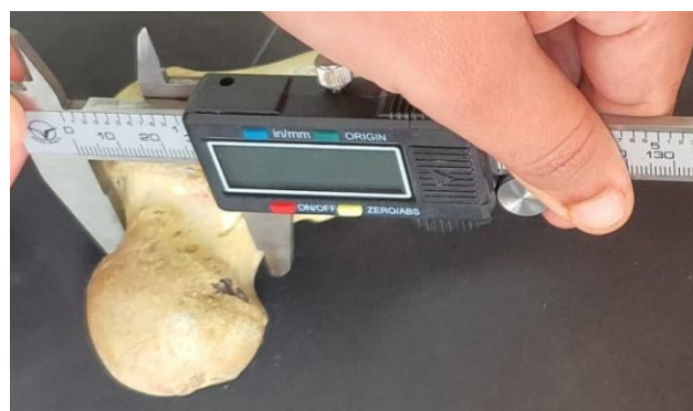
Figure 4: Femur neck diameter measured as the distance from the upper end to the lower end of the anatomical neck of femur in craniocaudal direction