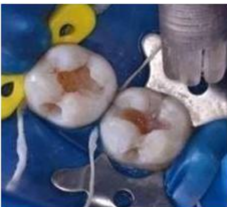
Etched enamel and moist dentin