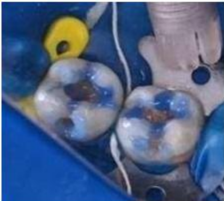
Selective enamel etching with 37% ortho phosphoric acid