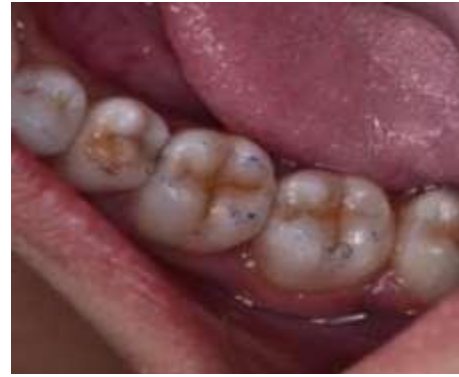
Occlusion is checked