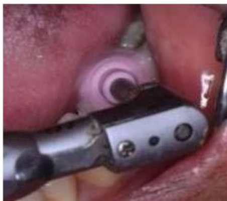
Polishing of restoration