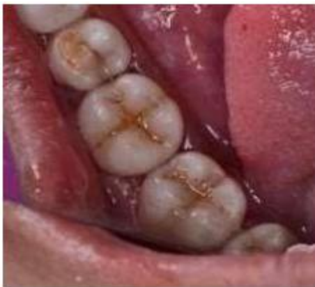
Application of stain to mimic natural tooth