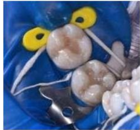
Incremental layering of composite 1mm short of occlusal level