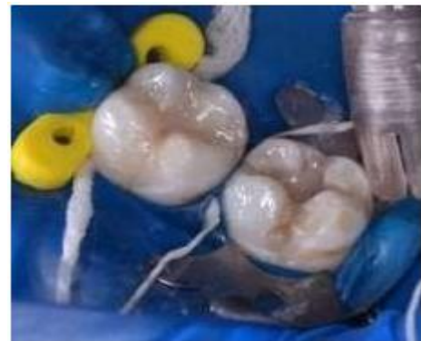
Placing final layer of composite