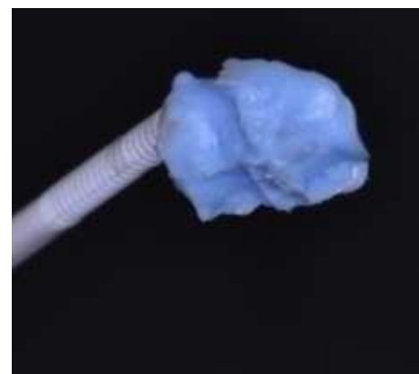
Occlusal stamp of first molar