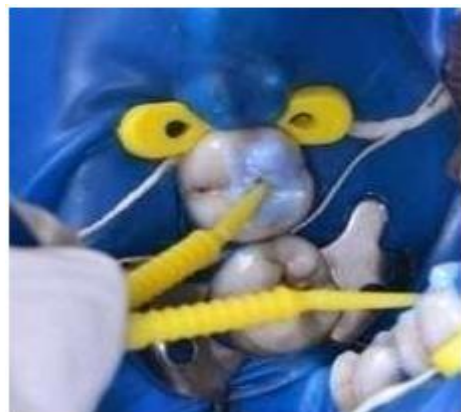
Liquid dam placed on the tooth and Micro brush is pressed before curing