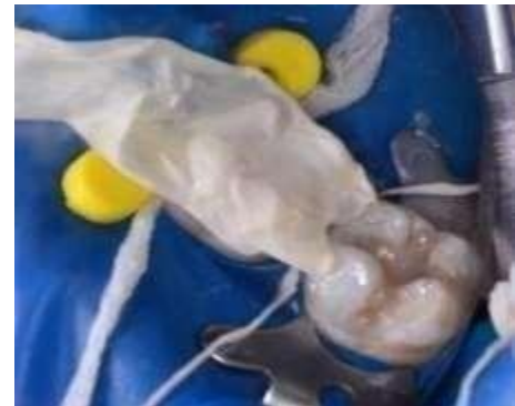
Teflon tape placed covering occlusal surface of tooth