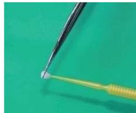
The tip of the microbrush is cut for better handling characteristics