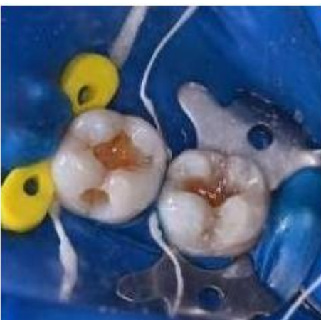
Application of 7 th generation bonding agent