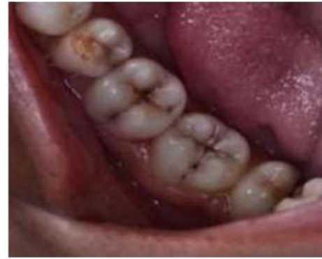
Pre – operative photograph, Class I superficial cavitated caries

After final increment was added, a teflon tape was applied onto the surface. The fabricated microbrush stamp was pressed over the teflon sheet. The resin composite was then cured. Artificial stain is applied to give the tooth a natural appearance. Polishing was carried out using soflex spirals and buffs.