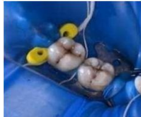
Rubber dam isolation