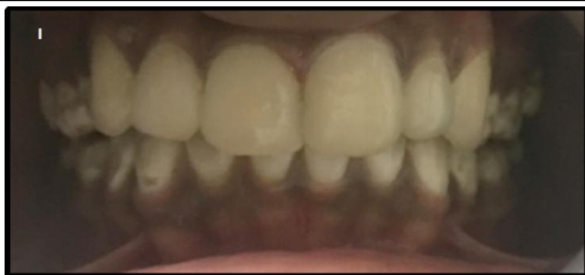
Fig I. Showing the composite veneers with maxillary right canine to left canine.