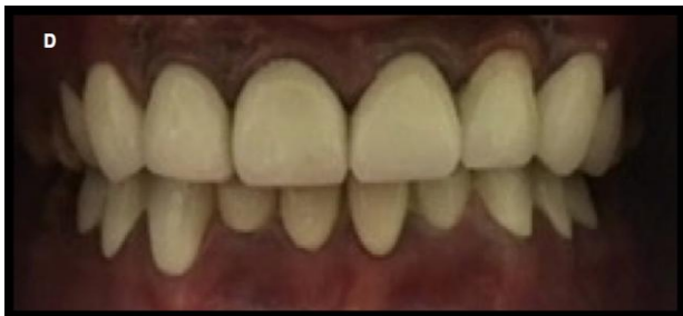
Fig D. Showing final prosthesis with maxillary right first Premolar to left premolar and mandibular right second premolar to left second premolar.