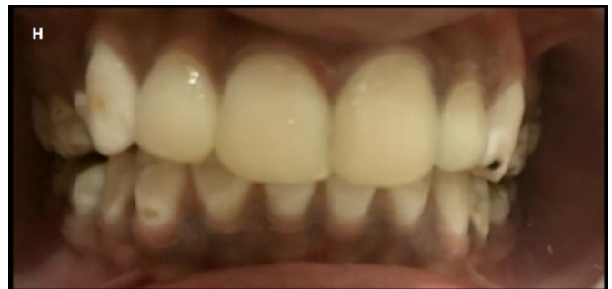
Fig H. Showing the composite veneers with maxillary laterals and incisors.