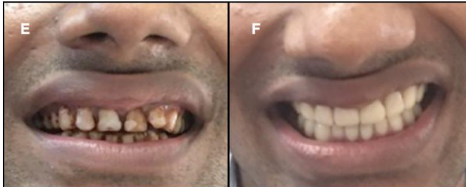
Fig E and F. Showing preoperative and post operative smiles of Case 1.