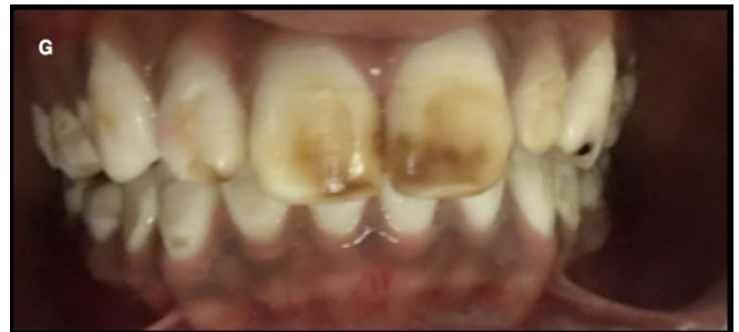
Fig G. Pre operative photograph showing severe discoloration of teeth of Case 2.

The initial phase of treatment started with oral prophylaxis, smile analysis, preliminary shade selection, photographs, study models to evaluate the occlusion. In next appointment tooth preparation for veneers with 12-22 i.e from maxillary right laterals to left laterals following the rubber dam isolation was done (Fig H). The composite resin used in the present case was nano-composite Metric N Ceram. (Ivoclar) shade A1 with Prime and Bond NT (Dentsply, India) as the bonding agent. Polishing of composite restoration was accomplished with Super Snap (Shofu Inc, Japan). Occlusal corrections were done and incisal guidance was established. After occlusal equilibrium got established Canines were prepared and veneered with same clinical protocols (Fig I). Now canine guided occlusion was established and checked. The final finishing and polishing was done after 24 hours of cementation. Post-operative photographs and instructions were given after the treatment procedure and patient was satisfied with the treatment outcome (Fig J).