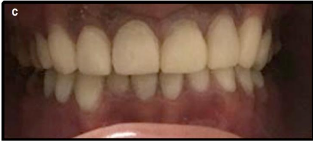
Fig C. Showing the temporization with maxillary right first Premolar to left premolar and mandibular right second premolar to left premolar.