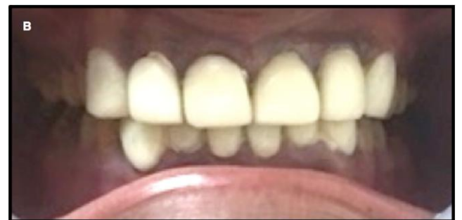
Fig B. Showing the temporization with maxillary laterals and incisors and mandibular anteriors.