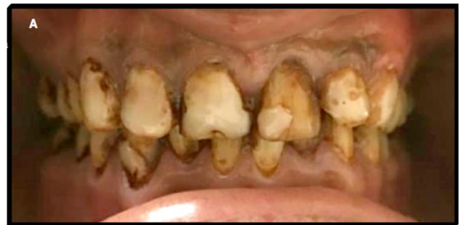
Fig A. Pre operative photograph showing severe discoloration of teeth of Case 1.

crown. In the next appointment patient was completely comfortable, he was able to chew his food properly, no TMJ findings were evident and patient was satisfied with the shape and form of the crowns, but patient was willing for even lighter and high value A1 shade from vita shade guide. After 1 month temporary crowns were removed and final impression were recorded following gingival retractions. The correct fits of full crown were verified both individually and collectively on the model and teeth (Fig D). The patient was satisfied with the form, shape, and shade of crowns and final cementation was done. Contact points and occlusion was checked and final finishing and polishing was subsequently done after 24 hours of cementation. Post-operative photographs and instructions were given after the treatment procedure and patient was satisfied with the treatment outcome (Fig E & F).