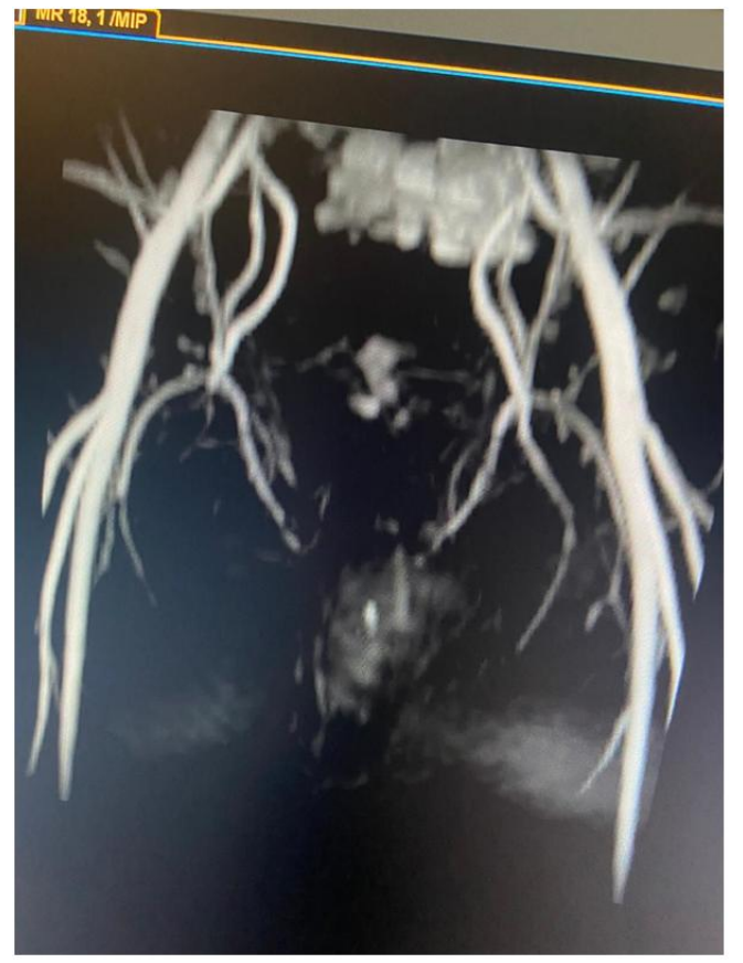
Figure 10 MR Digital Subtraction Angiography shows no evidence of vascular injury (superficial and deep dorsal vein of penis, dorsal artery and cavernosal artery).

A digital subtraction angiogram was also performed in all the patients to rule out penile artery injury. It showed hematoma formation and no contrast blush in 3 out of the 5 patients (Figure 10). None of the patients reported injury to superficial dorsal vein, deep dorsal vein, dorsal artery of penis or cavernosal arteries as no patient reported any evidence of vascular injury on digital subtraction angiogram.