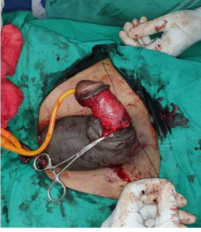
Figure 4 Repair of corpora cavernosa and tunica albuginea with vicryl 2-0 in a transverse fashion