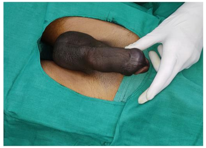
Figure 1: Egg plant deformity in penile fracture

experience in managing penile fracture, using MRI as a noninvasive documentary tool, in addition to its efficacy in depicting the anatomical details of the condition, which not only facilitates surgical intervention but also minimizes its morbidity.