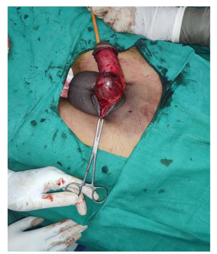
Figure 2: Shows hematoma formation below tunica albuginea

intercourse for 1 month. A cystoscopy was performed in patients with urethral injury who further had urethral stricture which was managed by optical internal urethrotomy.MR findings concerning the size, location, and orientation of tunical tear were confirmed at surgery. Patients' injury and MR findings are as shown in table 1.