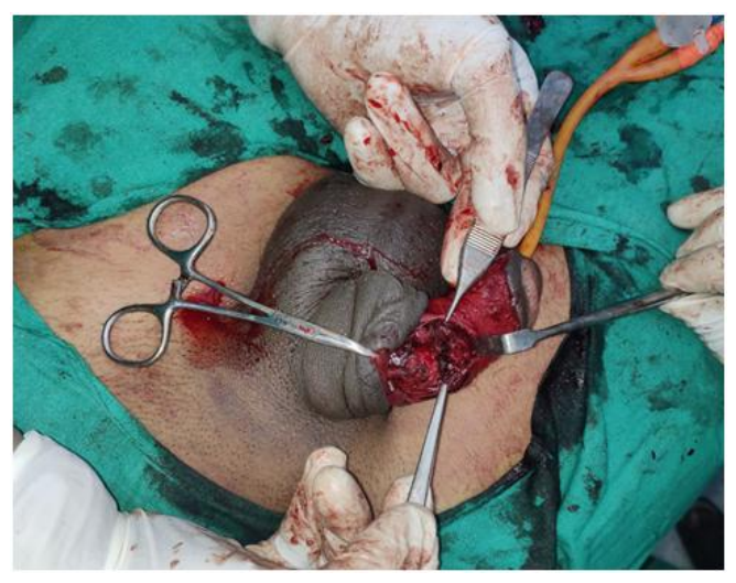
Figure 3: Shows tear in corpora cavernosa