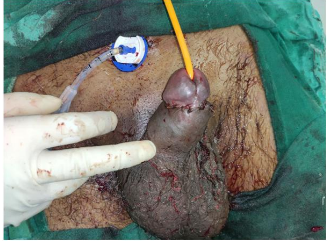
Figure 6 Final picture after Suprapubic Catheterisation and repair