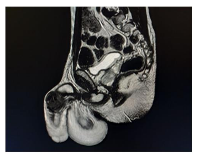
Figure 9 Shows intracavernosal hematoma formation under tunica albuginea

The presence of urethral or spongiosal involvement is of great importance because it necessitates urgent surgical intervention and is associated with a higher rate of complications. In our series, urethral rupture was seen at MR imaging in 2 patients. Corpus spongiosal rupture was correctly diagnosed at MR imaging in two patients (Figure 8), one of whom had hematuria.