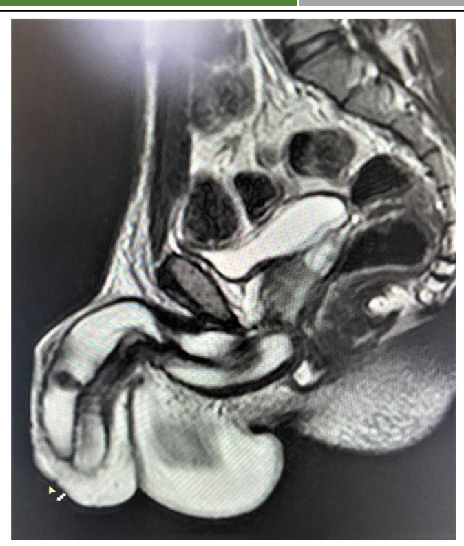
Figure 8 Defect in the corpora cavernosa and underlying hematoma. The fracture is situated 7.5 cm away from the tip of glans

Tunical tear was located in the ventral portion of the corpus cavernosum in 2 of the 5 patients who underwent surgery and in the lateral portion in the remaining patient. The tear was located in the proximal shaft in 1 patient and in the midshaft in four patients. No tear was found in the dorsal portion or distal shaft. The orientation of the tear was transverse in all patients (Figure 7). The size of the tear ranged from 8 to 15 mm.