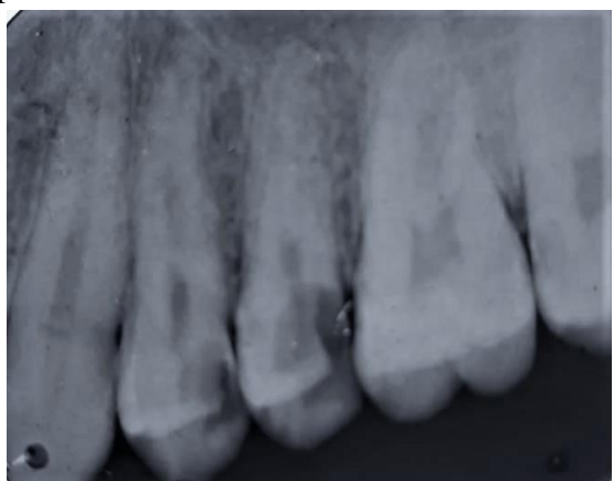
Figure 1 Preoperative radiograph showing greater MD width& a fast break for 24

Teeth were responded positively for percussive test, and negatively for thermal vitality test. On radiographic examination, radiolucency extending to pulp horn for 24 & 25 was evident. There was increased mesio- distal width radiographically for 24 in mid root region, and a fast break was noticed in tracing root canals for 24(Figure 1). That made a suspicion for 3 roots for maxillary first premolar and confirmed by multiple angulated radiographs. The diagnosis was made as acute irreversible pulpitis in relation to 24 & 25.