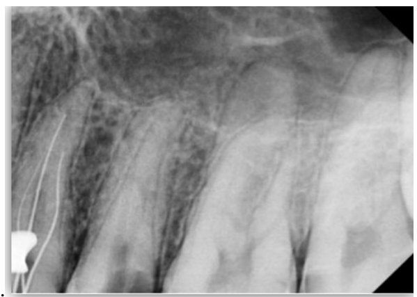
Figure 3 Establishing working length and confirmed by radiograph

The Oval shaped access preparation was made for 25.Patency was achieved for 24- using # 10 size K file for mesiobuccal and distobuccal canals,# 15 size K file for palatal canal. Patency for 25 was achieved with # 15 size K file. The working length was established with apex locator and confirmed radiographically for each root (Figure 3)