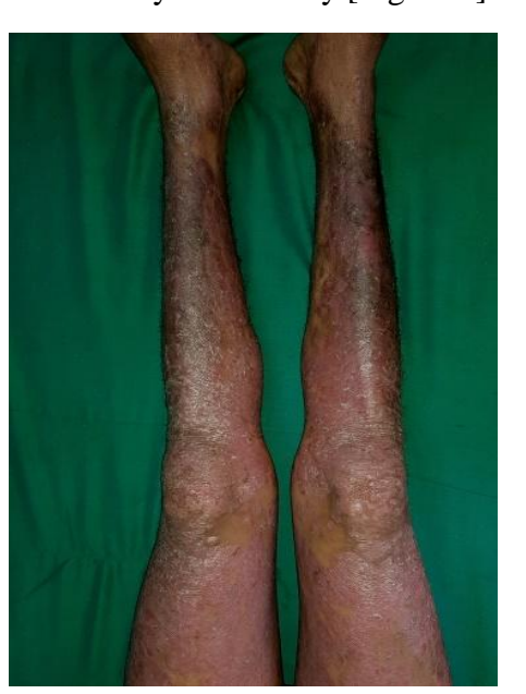
Figure 3 Showing well defined erythematous, scaly symmetrical plaques on lower limbs and hands

There were no nails, teeth, mucosal or hair abnormalities. There was no other systemic involvement.