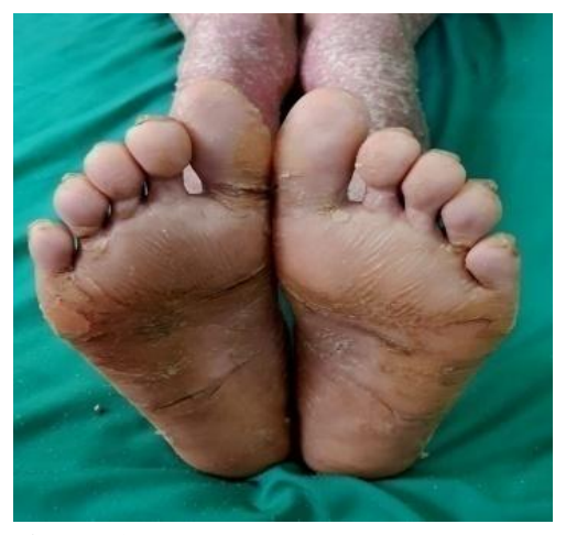
Figure 2 Showing plantar keratoderma

Multiple well defined erythematous scaly plaques were present over extensor aspect of both upper