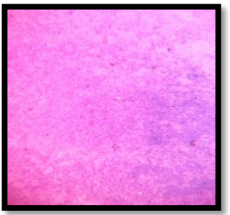
Fig 3: Necrosis on cytology smear