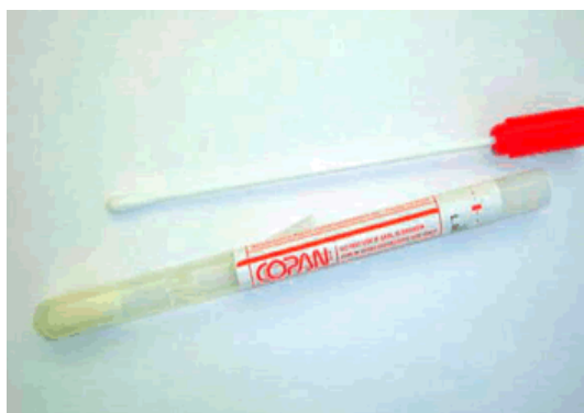
Figure 1: Wound swab for collection of specimen

Overall 101 surface swabs taken from 101 patients over a span of 6 months.