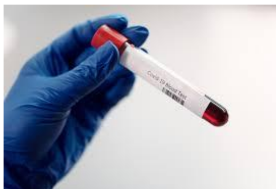
Figure: III Diagnostic Evaluation of COVID-19