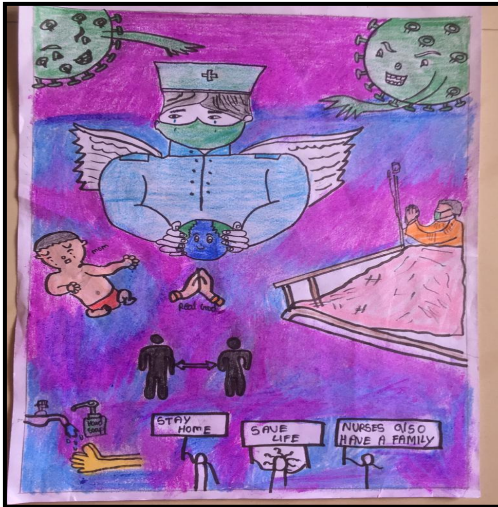
Figure: IV Picture Reveals Role of Nurse during COVID-19