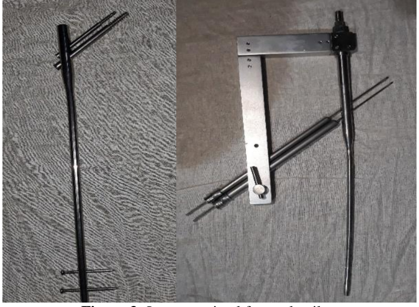
Figure 3: Long proximal femoral nail