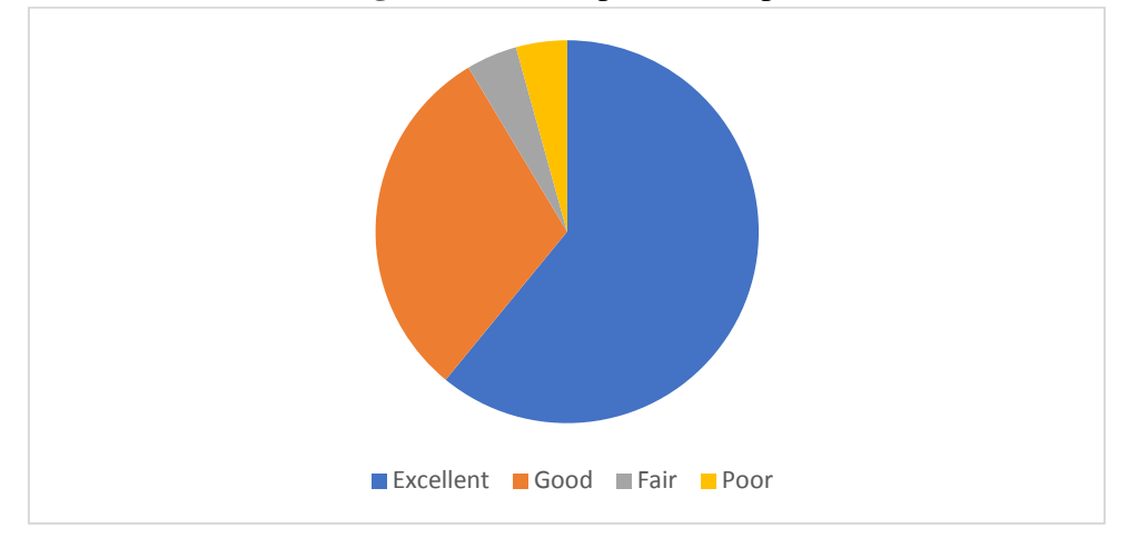
Amit Thakur et al JMSCR Volume 08 Issue 02 February 2020