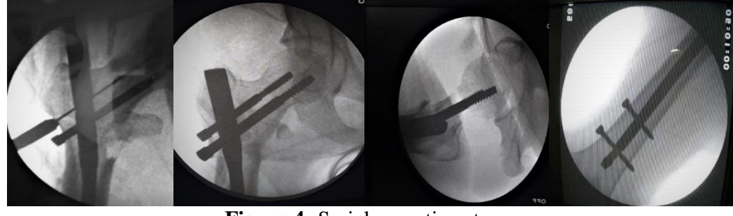
Figure 4: Serial operative steps

subchondral area of the lower half of the femoral head. An additional 6.5 mm antirotation hip pin is placed through the proximal part of the nail into the upper half of the femoral neck to prevent rotation of head-neck fragment. The tip is specially shaped to reduce stress concentration. Distally, the nail can be locked statically or dynamically by using either the round or oval locking hole.