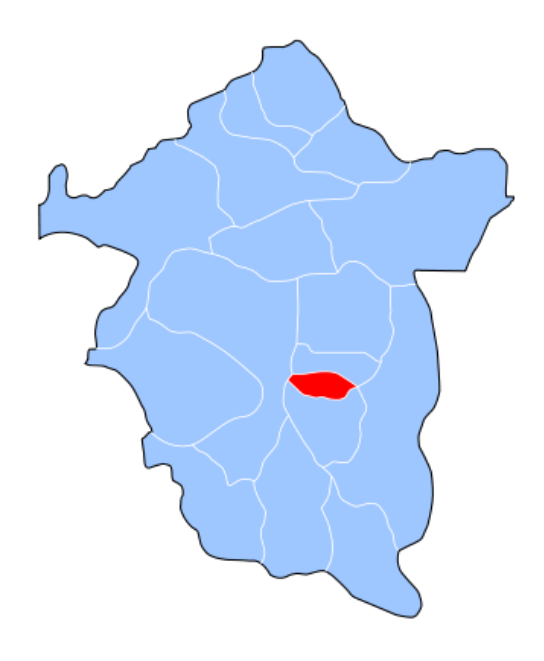
Figure 1 Map of Enugu South Local Government Area

Medications instrument and manpower used in the management of ENT diseases were not available in all the primary health centres in Enugu South Local Government. The only functional ENT centre has the following human and material resources as indicated in Table (1)