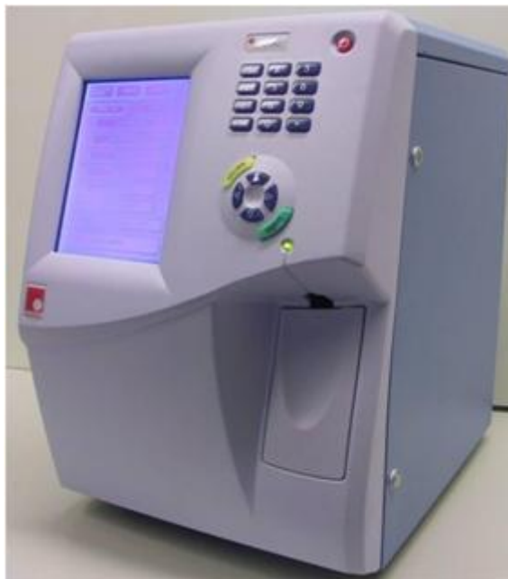
Figure No.4 – Mythic 3part Cell Counter