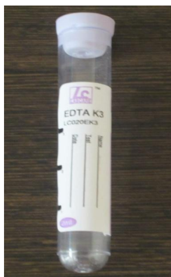
Figure No.5 – K3 EDTA tube