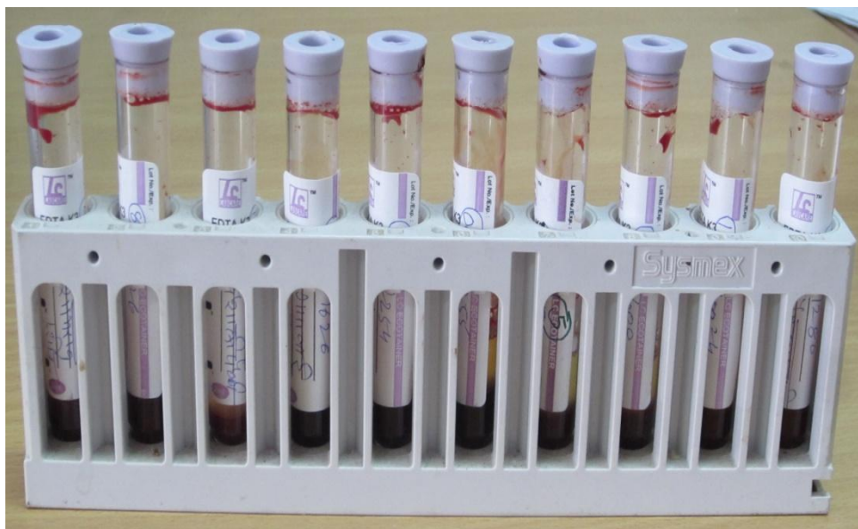
Figure No.3 – Sampler Mode of Sysmex XS 1000i 5part counter