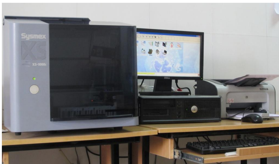
Figure No.2 – Sysmex XS 1000i 5part counter