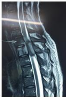
Pre operative MRI ( Sagittal)