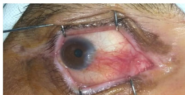
Figure 1 and 2: Showing pre operative eye and post operative 2 weeks after pterygium excision