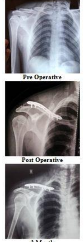
Fig-1: Case Illustration