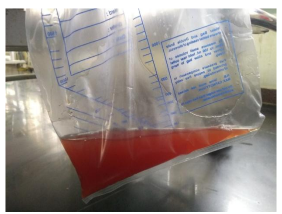
1 day after avil tablet poisoning

later, his urine became cola colored. It become most effective then his family admitted that he had ate up 40 capsules of Avil 50 (pheniramine maleate 45.3 mg/tab) 8 hours prior to admission. Patient used to take this tablet for symptoms of rhinorhoea. There become no different records that would provide an explanation for his excessive colored urine.