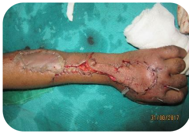
Preservation of venoadipofascial sleeve and exteriorization of pedicle

cm of venoadipofascial tissue should be included on each side of septum.