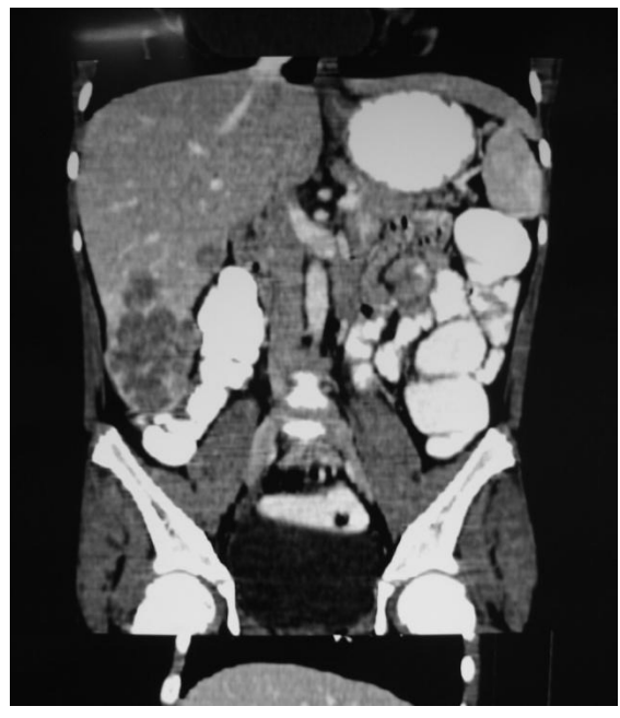
Figure 2: CT image showing Hepatoblastoma - right lobe of liver