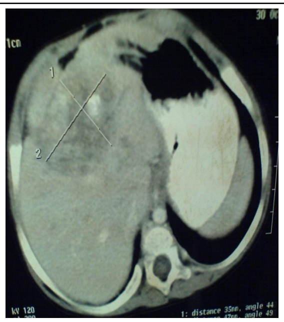
Figure 1: CT image showing Hepatoblastoma of the Right lobe