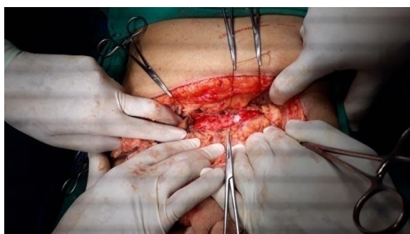
Patington – Rolchelle procedure

Follow-up and comparison was done keeping pain recovery, exocrine function, endocrine function and residual/recurrent stone as the criterias.