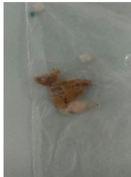
Fig 5 Peanut Shell Removed From RT Trachea