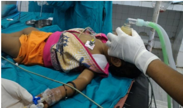
Fig 1: Pre oxygenation

examination of both the right and left bronchus along with oral cavity for any remaining foreign body or any trauma, the bronchoscope was retrieved and ventilation with 100% oxygenation started. Patient was on spontaneous ventilation. Anaesthesia was maintained with sevoflurane along with propofol intravenous. Patient recovered well with no complications. Postoperative chest radiograph was taken to rule out any further complications