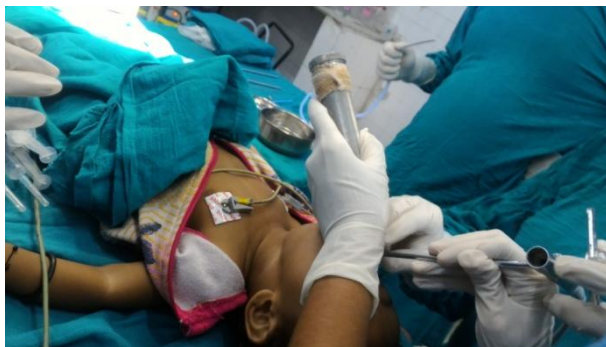
Fig 2: Intubation