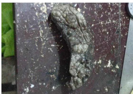
Figure 3. Gross picture of mix nodular cirrhosis of liver