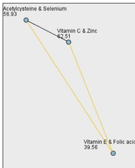
Pairwise Comparisons of Group

Each node shows the sample average rank of Group.