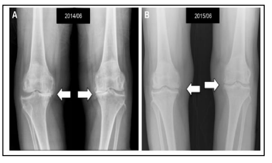
Figure: 1a and 1b: Osteoarthritis and improved condition patients after treatment of PRP<sup>[3]</sup>