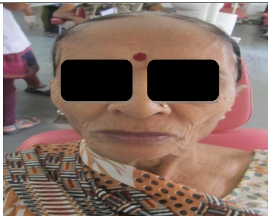
Anterior view: Normal extraoral appearance

The diagnosis of hypercementosis is made based on the characteristic radiographic features described. Hypercementosis does not require treatment. In cases where extraction of an affected tooth is necessary, the tooth may be sectioned to facilitate removal.