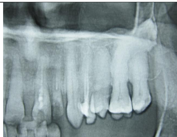
Maxillary teeth: Teeth affected by hypercementosis exhibit a bulbous, thickened appearance of the root surface and normal-appearing periodontal ligament space and intact lamina dura