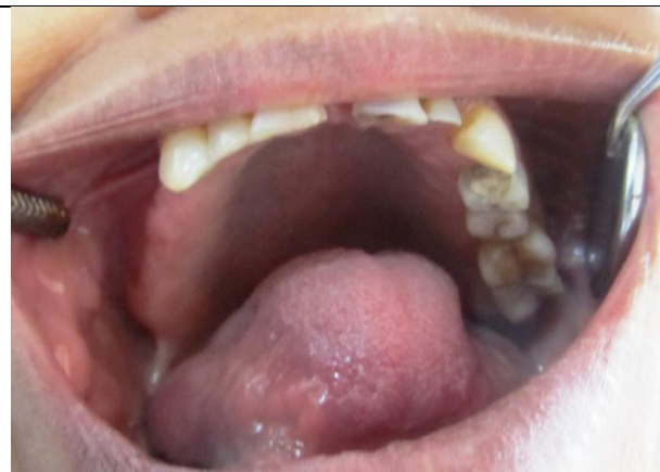
Intraoral view: No significant changes