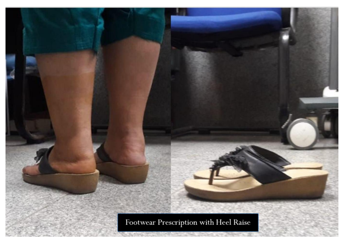
Figure-2 Footwear Prescription with Heel Raise

centrifuge machine with 1000 revolutions per minute for 10 minutes. USG guided intra-tendinous injection of PRP was given thrice (4 weeks apart). An out of plane approach was used to minimize further injury to the tendon. A below knee cast was applied for a period of 15 days on all three occasions immediately following injection. Half an inch heel raise was advised following cast removal.