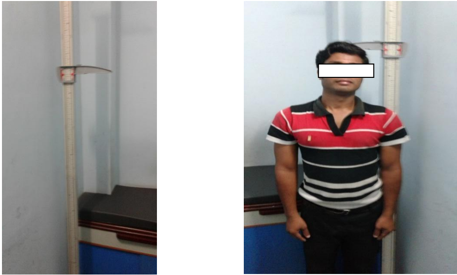
Figure 1 a, b: Height measurement by using standard anthropometric instruments

Foot length was measured as a direct distance from the most prominent point of the back of the heel to the tip of the great toe or tip of the second toe which one is longer. Foot length for the both sides was measured as the distance from the most prominent part of the heel backward to the most distal part of the longest toe (2nd or 1st).