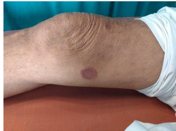
Figure 1-4 showing lesions of granuloma annulare

upper and lower limbs with no surface changes. On examination of his hands there was flexion deformity involving the ring finger with a band of fibrotic tissue extending from base of the ring finger up to the mid palm in both palms. Biopsy of skin lesions showed infiltrate of histiocytes and lymphocytes scattered between the collagen bundles with separation of collagen fibers by mucin along with sparse perivascular lymphocytic infiltrate and unremarkable epidermis. Patient's investigations revealed increased blood sugar (Fasting blood sugar 173mg/dl) and HbA1C of 7.2%. Patient was diagnosed as Type 2 DM with granuloma annulare with dupuytren contractures and was started on antidiabetic treatment, along with topical clobetasol ointment for granuloma annulare and intralesional triamcinolone for dupuytren contractures.