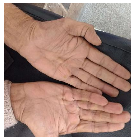
Figure showing bilateral dupuytren's contracture