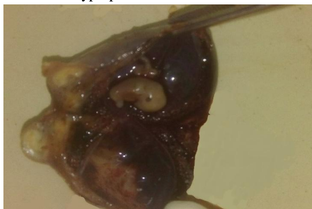
Fig. 1 Gross photograph showing dilated fallopian tube with an embryo.

Sections of the tube medial to the site of EP showed dense and diffuse infiltration of the wall and plicae by lymphocytes and plasma cells in 36 cases. Variable number of mast cells were also seen. The inflammatory infiltrate extended to the parametrium and serosa thus constituting pelvic inflammatory disease (PID). In 5 out of these 36 cases there was plical fusion dividing the tubal lumen into multiple epithelium lined channels – follicular salpingitis (Fig. 3). Five cases showed mesothelial hyperplasia.