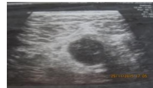
Fig -1 Ultra sonography showing hypoechoic mass with echogenic particles

A 30 year male presented to our OPD with history of recurrent purulent, cheesy discharge from umbilicus since adolescence. At the time of presentation patient was afebrile. The physical examination revealed periumbilical tenderness, erythema and discharge from the umbilicus. There were no signs of general infection. The laboratory tests were all within the normal limits. Urine culture was sterile. On ultra sound hypoechoic area of size 3x3 cm with echogenic particles inside present. On further investigation with CECT abdomen revealed sinus tract of size 1.2 cm with external opening at the umbilicus was present. Preoperative cystoscopy shows normal bladder finding. Provisional diagnosis was infected urachal sinus. Excision of the tract with median ligament and cuff of bladder was removed. Follow up at 12 month patient is doing fine with no fresh complaints.