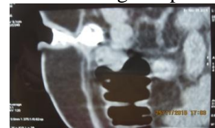
Fig-2 CT Sinogram showing Urachalsinus.