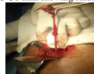
Fig -4 Removal of sinus tract with median ligament with bladder cuff.