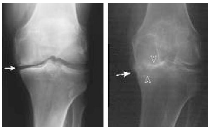
Figure 3: Radiological knee osteoarthritis (RKOA) in study participant