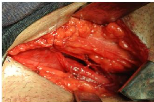
Figure-4: Closure of external oblique over the inguinal canal with the cord structures inside.