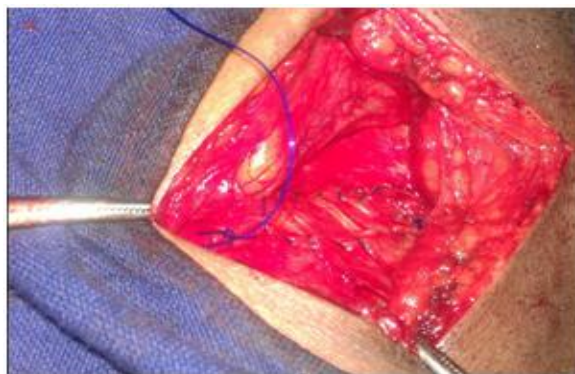
Figure-3: Upper end of Undetached external oblique strip sutured to conjoint tendon