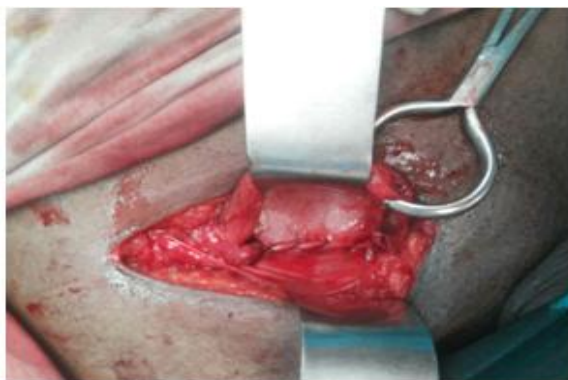
Figure-1: Suturing of Upper Leaf of external Oblique to Inguinal Ligament

The Statistical software namely SAS 9.2, SPSS 15.0, Stata10.1, MedCalc 9.0.1, Systat 12.0 and R environment ver.2.11.1 were used for the analysis of the data and Microsoft word and Excel have been used to generate graphs, tables etc.