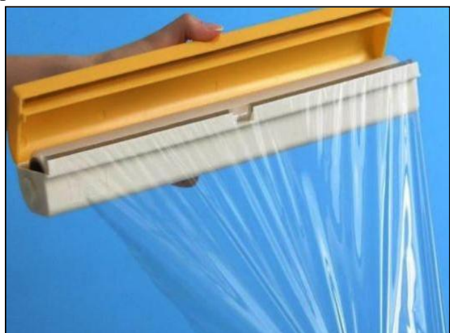
Plastic sheet used in the study