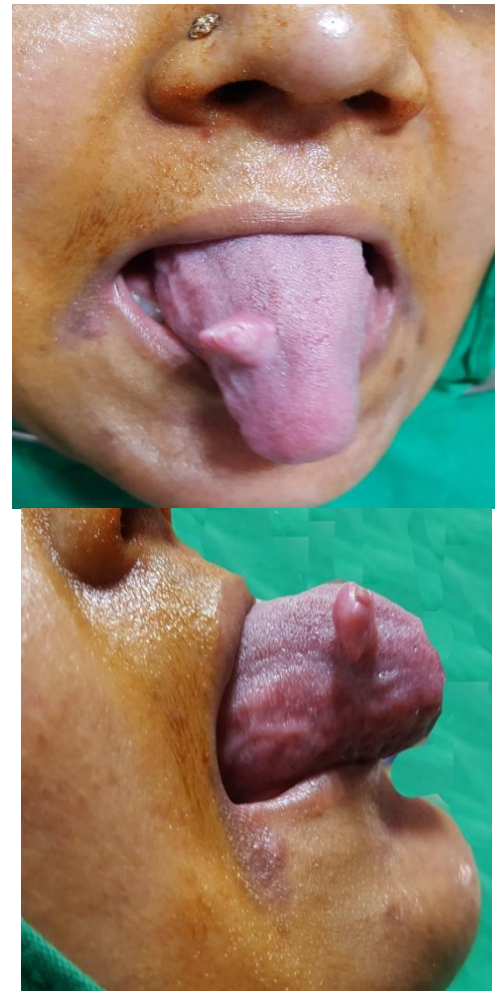
Fig.1 : Intra oral presentation of the growth on the dorsum of tongue.