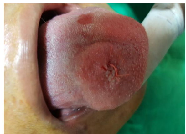
Fig 2: Primary closure after surgical excision