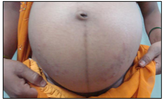
Fig 3: Linea nigra and striae gravidarum.