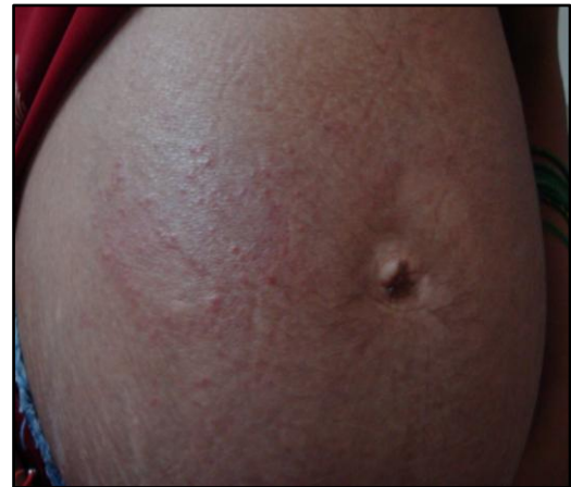
Fig 12: Tinea corporis