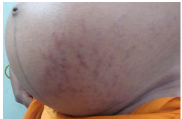
Fig 5: PUPPP lesions along the striae.