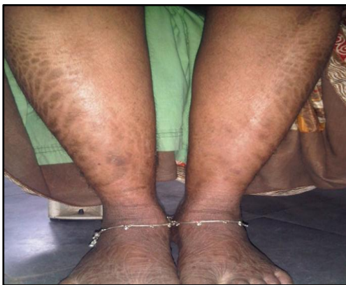
Fig 9: Lamellar ichthyosis in a pregnant women