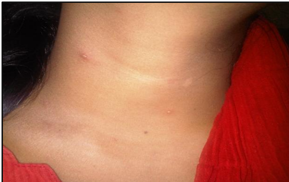
Fig 8: Varicella