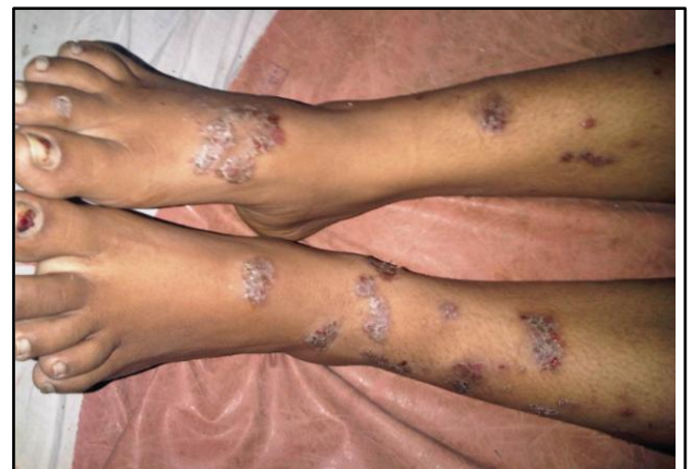
Fig 6: Prurigo of pregnancy.