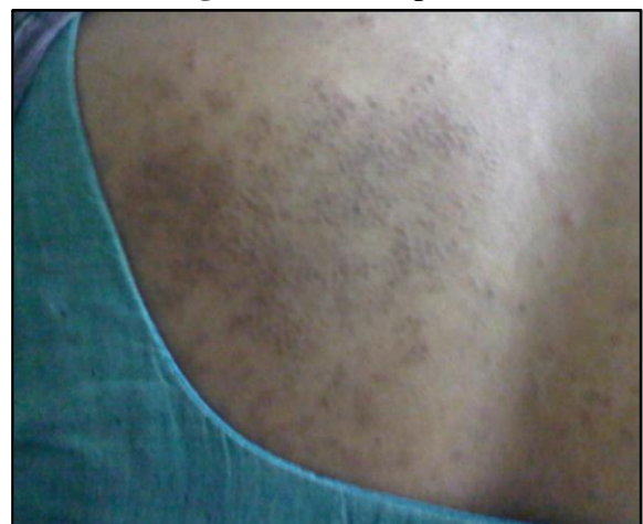
Fig 13: Amyloidosis.