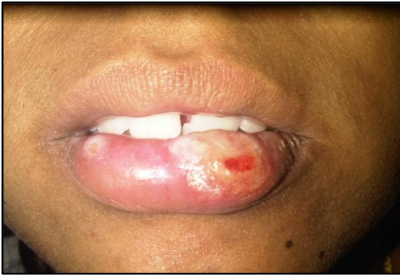
Fig 7: Herpes labialis.