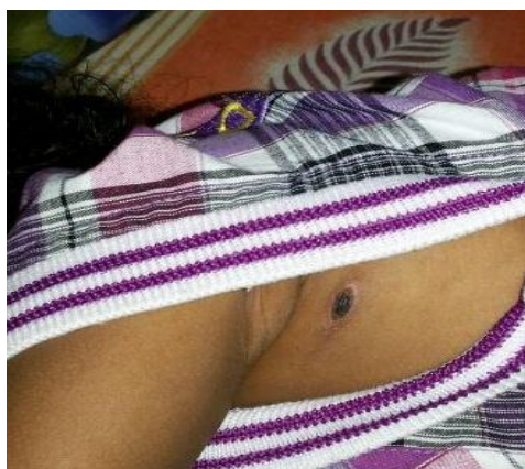
Figure 1: Solitary eschar below left axilla