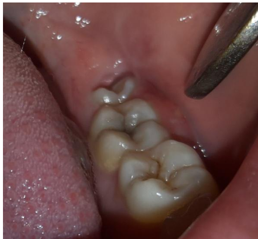
Vertically impacted third molar

were male patients. Triangular incision was given. Then buccal guttering up to cemento enamel junction was done both buccally as well as distally with sparing of disto lingual plate. Then purchase point was made using straight round bur on the buccal aspect of third molars. The purchase point was made such that it is at equal level or very slightly below the fulcrum. In case of position b or position c the buccal bone was reduced deep up to the purchase as shown in figure 1, so that their position is at the equal level. Then cross bar was engaged into the purchase point such that while rotating the vector of force is along the path of withdrawal. By this way there is compressive force at the fulcrum rather than tensile so there is least chance of fracture of mandible.