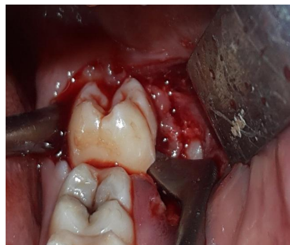
tooth elevated in toto