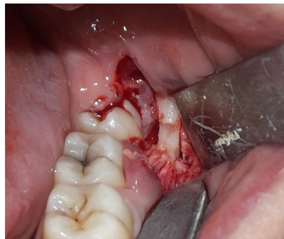
buccal gutter with deepened fulcrum