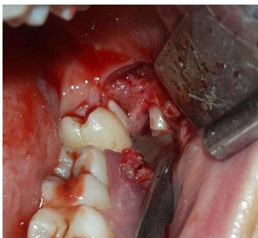
Cross bar engaged