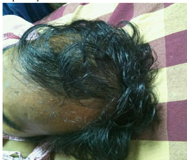
Alopecia over Scalp Region

A final diagnosis of systemic lupus erythematosus-scleroderma overlap syndrome was made and patient was started on pulse therapy of steroids. however, patient developed breathlessness and fall in oxygen saturation and was shifted to ICU but succumbed due to respiratory failure.