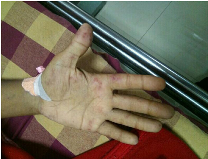
Subcutaneous Nodules on Hand