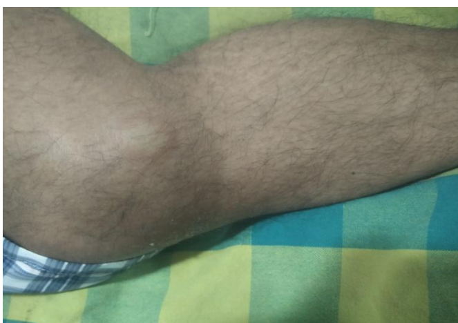
Subcutaneous Nodule over Knee Region