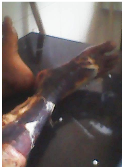
A patient with lower limb Necrotising Fasciitis

The most common site of infection observed in our study is the lower limbs 91%. Next common site of infection is perineum (5.5%) followed by upper limbs and abdomen (1.7% respectively).