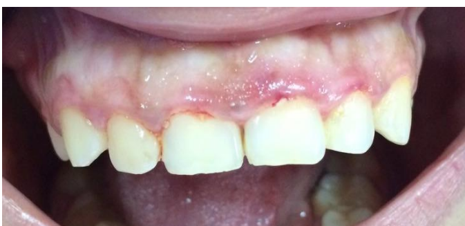
Figure-2: Preoperative intraoral view

Based on anatomy of the gum line, the crown lengthening surgical procedure has been a line our treatment for aesthetic excess cases the gingival tissue where there no periodontal disease, the patient was photographed (Figure 2), molded and then the study models were made, through which diagnostic wax-up was created and it was possible to designed the clinical crown enhancement surgical procedures with all its functional and aesthetic characteristics for the patient.