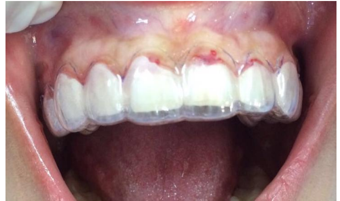
Figure-3: New gum margin registration

edge and the cervical bone was recorded. This distance should be about 3 mm for biologic width maintenance. The creation of precise biologic width requires an additional osseous contouring which was performed using manual instrument then (Figure 5), the flap was sutured (Figure 6).