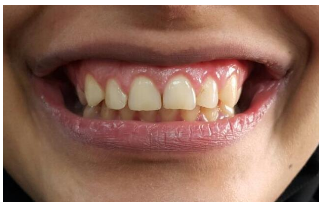
Figure-7: 6-months follow up