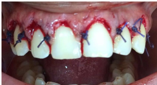
Figure-6: Future of the surgical region