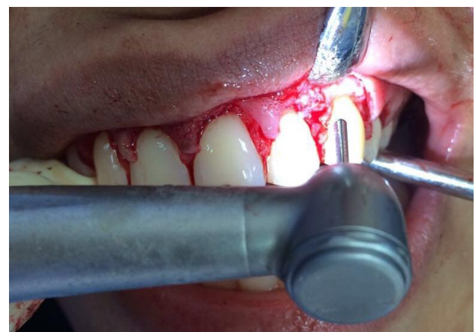
Figure-5: Osseous contouring