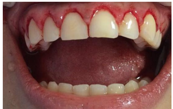
Figure-4: Gingival collar extracted