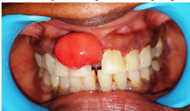
Fig 1 Preoperative View

smooth and erythematous (Fig 1). Periodontal status was moderate with calculus and soft debris was present. There was no mobility of involved tooth. Radiographic evaluation revealed horizontal bone loss in upper central region (Fig 2). She was not having any systemic illness. Routine blood examinations were within normal limit. After the clinical and radiographic evaluation a provisional diagnosis of irritational fibroma was made. Excisional biopsy was planned along with full mouth prophylaxis and root planning. Under local anesthesia excision of the growth was carried out, intraoperative and postoperative periods were uneventful. The patient was kept under regular follow up. Histopathological examination revealed clusters of globular cementum like material in acellular connective tissue stroma. Plum active fibroblasts are seen with scanty inflammatory cells. Section shows moderate vascularity (Fig 3). Considering the clinical, radiographic and histopathological examination a final diagnosis of Peripheral cementifying fibroma was made. The patient was kept under regular follow up (Fig 4).