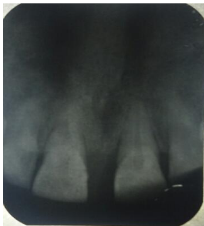
Fig 2 Radiographic View