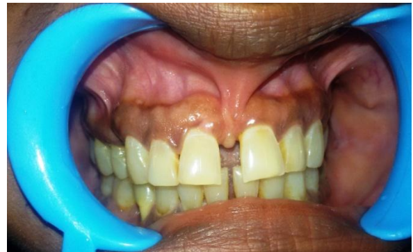
Fig 4 Postoperative View (6 Months)