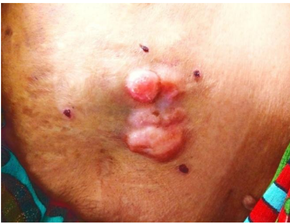
Figure 1 & 2: Picture shows protruding swelling in left hypochondrium having pinkish appearance.

On examination, the skin over the swelling showed tiny red nodules with no discharge from them. On palpation, there was an irregular mass of approximately 6cm by 4cm that was hard and fixed to the skin (Figure 1 & 2). Chest radiograph and routine blood investigations were found to be within normal limits. On ultrasound examination, it suggested a 5.4cm by 3.5cm heterogenous hypoechoic lesion within the subcutaneous and intramuscular plane of the anterior abdominal wall. Trucut biopsy was sent from the tissue and it suggested a low grade spindle cell neoplasm.