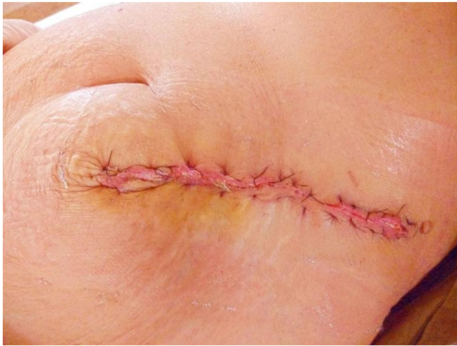
Figure 5: Picture shows post-operative outcome of the patient

The patient had an uneventful post operative period, and is still being followed up in the outpatient clinic for local recurrence (Figure 5).