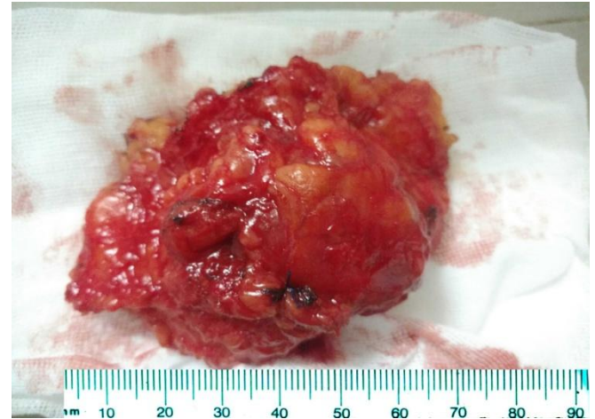
Figure 3: Picture shows gross appearance of the mass of approx 8x6x4.5cm

Wide local excision of the mass with a surgical margin of 3cm was done and the specimen was sent for histopathological examination.