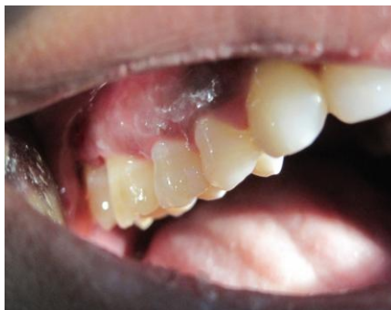
Figure 4. Post Operative Healing.