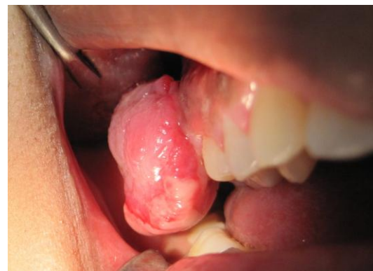
Figure 1. Buccal view of Pyogenic Granuloma.

varied from 0.5cm in diameter up to 2.5cm (Fig.1).