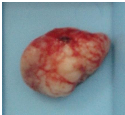
Figure 3. Excised Granuloma.