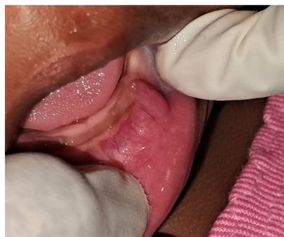
Fig: 2. Initial examination of lesion.

colour of the lesion was similar to that of oral mucosa. An initial provisional diagnosis of a fibroepithelial polyp was made and the child was kept on follow-up.