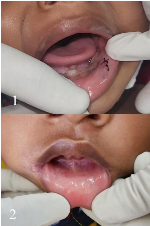
Fig: 5. (1) Sutured with 4-0 black braided silk, (2) Follow up after 2 months.

The suture was removed after a week. Follow-up of the patient after 2 months revealed a resolving lesion (Fig: 5).