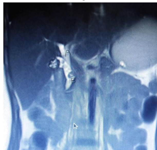
Figure 2 sagittal view .A) common hepatic duct proximal dilated part .B)cystic duct with stone compressing common bile duct .C)gallbladder with multiple stones.

A) Dilated proximal common bile duct. B) Cystic duct with stone compressing common bile duct. C) Gall bladder with multiple calculi.