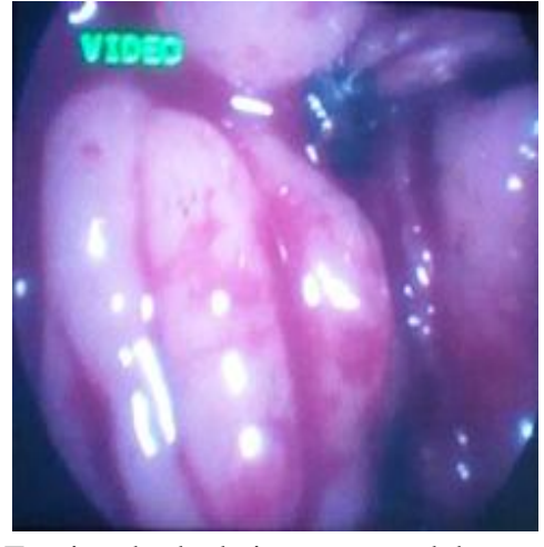
Fig.4 Foreign body being removed by upturned blakesley forceps.