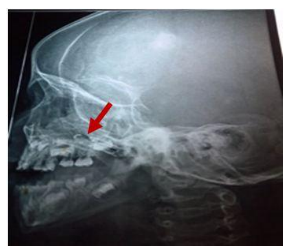
Fig.2 X-ray nasopharynx showing radio opaque foreign body along the floor of nasal cavity and nasopharynx.

X -ray skull lateral view and PNS water's view were taken which showed a radio opaque foreign body visualized in the nasopharynx. Endoscopic examination and removal of foreign body under general anaesthesia was planned for the child.