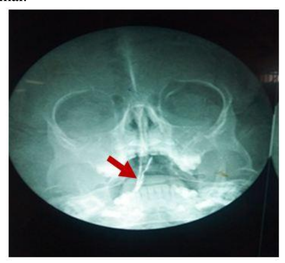
Fig.1 X-ray PNS water's view showing radio opaque foreign inside the mouth/ hard palate region.

On general examination, the child was playful, afebrile, with no apparent signs of respiratory distress. On anterior rhinoscopy nasal septum was in midline with foul smelling nasal discharge in both nasal cavities. Examination of oropharynx reveals bilateral grade one tonsillar enlargement. Examination of oral cavity and ear appears normal.