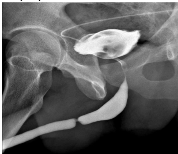
Fig 1. short segment stricture penobulbar urethra