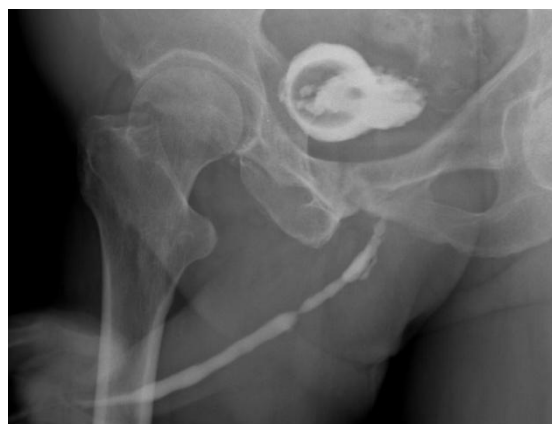
Fig 4. multiple urethral strictures