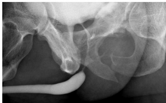
Fig 3. post-traumatic stricture bulbar urethra

In a study period of one year, April 2014 to March 2015, 478 patients with clinical symptoms suggesting stricture urethra were undergone retrograde urethrography in the department, of them 192 cases were normal. In the remaining 286 patients, radiological findings were evaluated in detail. Based on the location, the strictures were divided into bulbar, bulbomembranous, membranous, anterior penile, penobulbar and multiple strictures. The strictures are either complete or partial (fig.1-4). Bulbar segment is the commonest site of stricture in our study (160 out of 286) followed by bulbomembranous segment. Multiple penile strictures were found in 24 patients.(fig.5). In most of the cases the strictures were post traumatic. All the patients have undergone various surgical procedures including visual internal urethrotomy, end to end anastomosis, buccal mucosal augmentation urethroplasty etc.