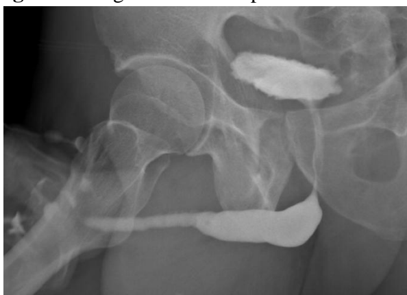
Fig 2. long segment stricture anterior urethra