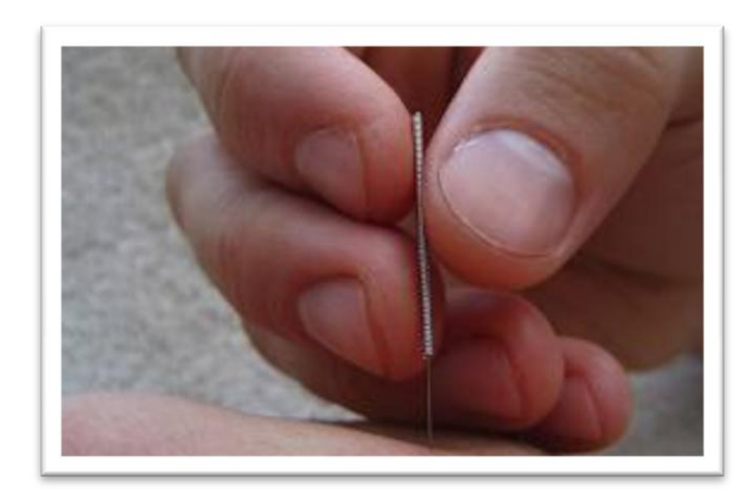
Fig.2 Handle of the needle

middle finger backing the index finger near the needle root (Fig.2).