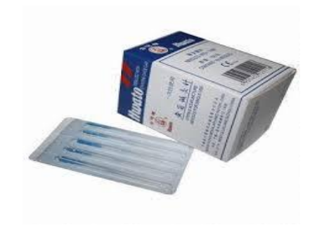
Fig.1. Acupuncture needle

In this study acupuncture needles were utilized as a source of therapeutic approaches. The advantages of using acupuncture are in the significant effects due to increase endorphin levels in the aqueous humor which could account for part of the ocular hypotension<sup>18</sup>. The tools were used in this study are disposable sterilized stainless steel acupuncture needles size 0.25mm diameter × 30mm length (Suzhou Medical Appliance Factory, China) . Fig 1