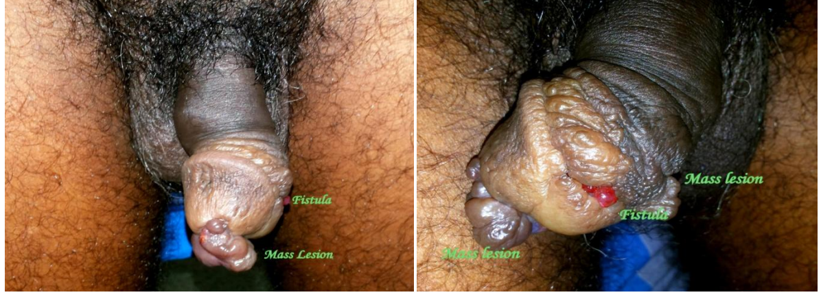
1a). & 1b). Polypoidal mass Lesion & Urethral Fistula

on gentle palpation from ulcer & urethral fistula found over left lateral side of sub coronal region. Among laboratory investigations, hematological and renal biochemical parameters was normal except Hb% was 9.8 gm/dl. Cystourethroscopy was suggested but scope could not pass. On histopathological examination, a nonspecific chronic infiltration of plasma cells lymphocytes encircling sporangia in different stages of maturity, enclosed in a double chitinous cellwall, leading diagnosis to a rhinosporidiosis. Patient was initially put on medical treatment of oral Dapsone for around six months but these was no improvement of symptoms as well as no regression of lesion. Partial amputation of penis done to get a free margin due to extensive lesion & urethral fistula. Post operative period was uneventful & follow up cystoscopy after 3 months was within normal limit.