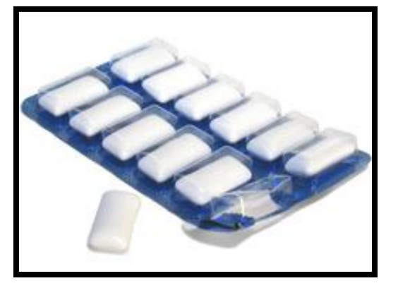
Fig.2 Nicotine Chewing Gum