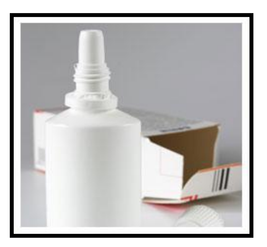
Fig.4 Nasal Spray