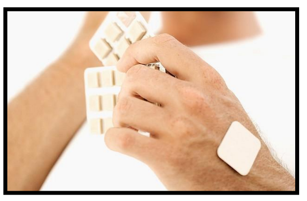
Fig.1 Transdermal nicotine patch